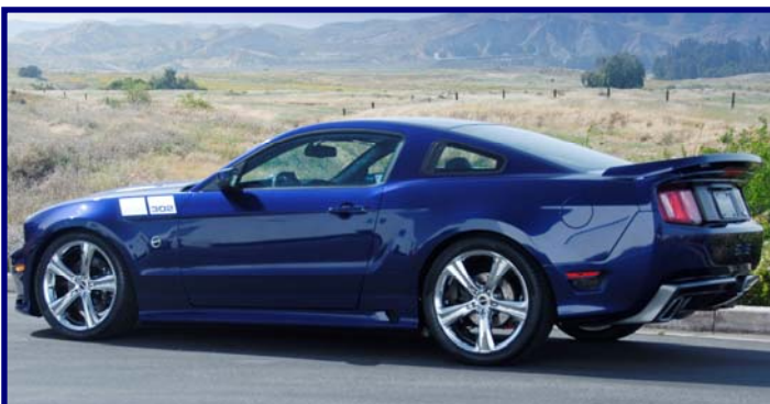
Above: SMS 302 Mustang. www.smssupercars.com

Source: SMS Supercars and Saleen Owners and Enthusiasts Club Exclusive portions of story © Copyright 2011 Saleen Owners and Enthusiasts Club Freely distribute with proper credits. Link to this story at: http://saleenforums.soec.org/showthread.php?p=54205