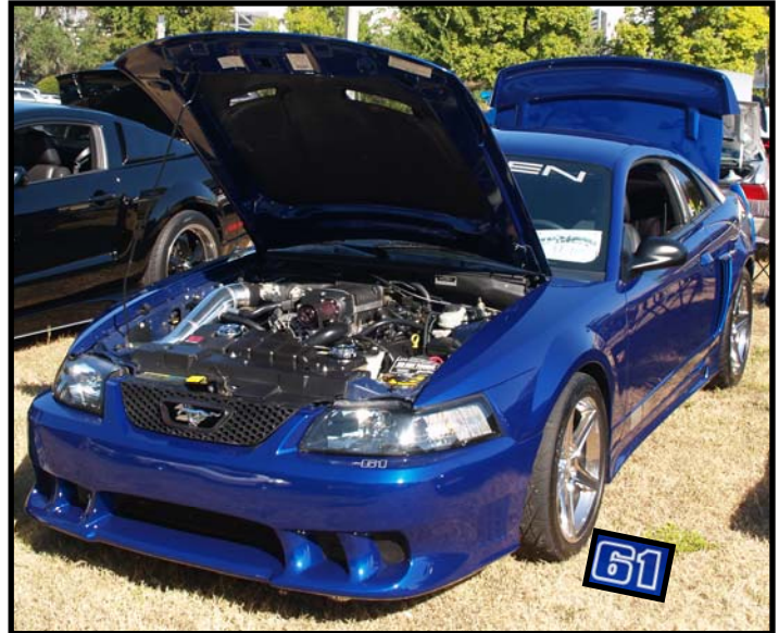
Above and below: S281 Saleens at the MOSI Show, October 23, 2010.