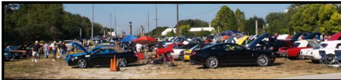
Above and below: Show field, Mustang Club of Tampa show, October 23, 2010.