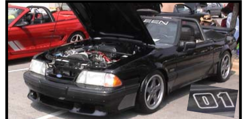
Above: Saleen #91-001 in Kansas City, Kansas at the MCA National Show on June 25, 2005.