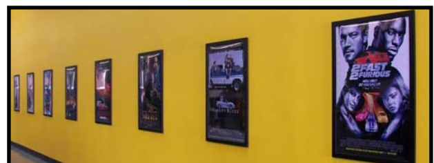
Below: Saleen Wall of Fame - Saleens in the movies.