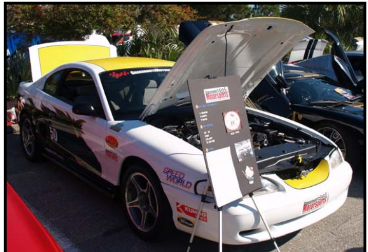
Above: Grassroots Motorsports Mustang.