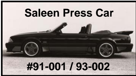
Saleen Press Car