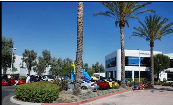
Above and below: Saleens and SMS vehicles on display at the SMS Supercars show on September 18, 2010.

Hellionsaleen: "It was nice to reacquaint with new and old Saleen enthusiasts. "