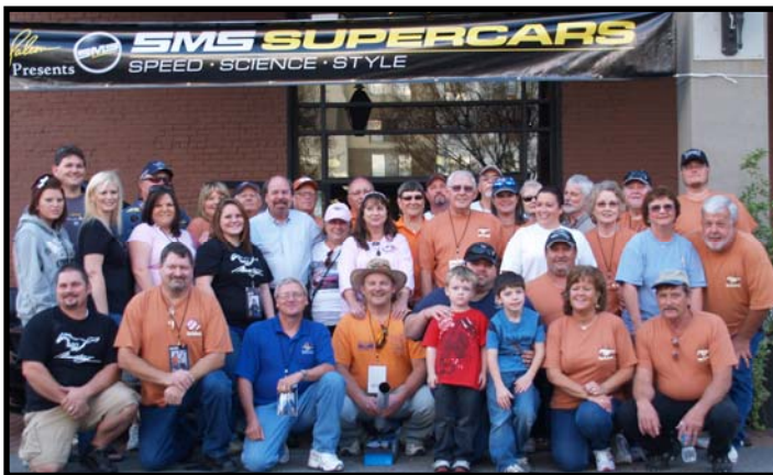
Above: The Magic City Mustang Club hosted the meet and greet held for Steve Saleen at Adamson Ford, Birmingham, Alabama on November 21, 2010. www.magiccitymustangs.com

Celebrating the community, culture and company of automotive enthusiasts! Join Steve Saleen, the Saleen family, and the team at SMS Supercars as we welcome the Saleen Owners and Enthusiasts Club and all Saleen and SMS owners and enthusiasts at their 3rd annual open house and car show. This is the true continuation of the annual Saleen Show in Irvine, and the world's largest gathering of Saleens in the world!