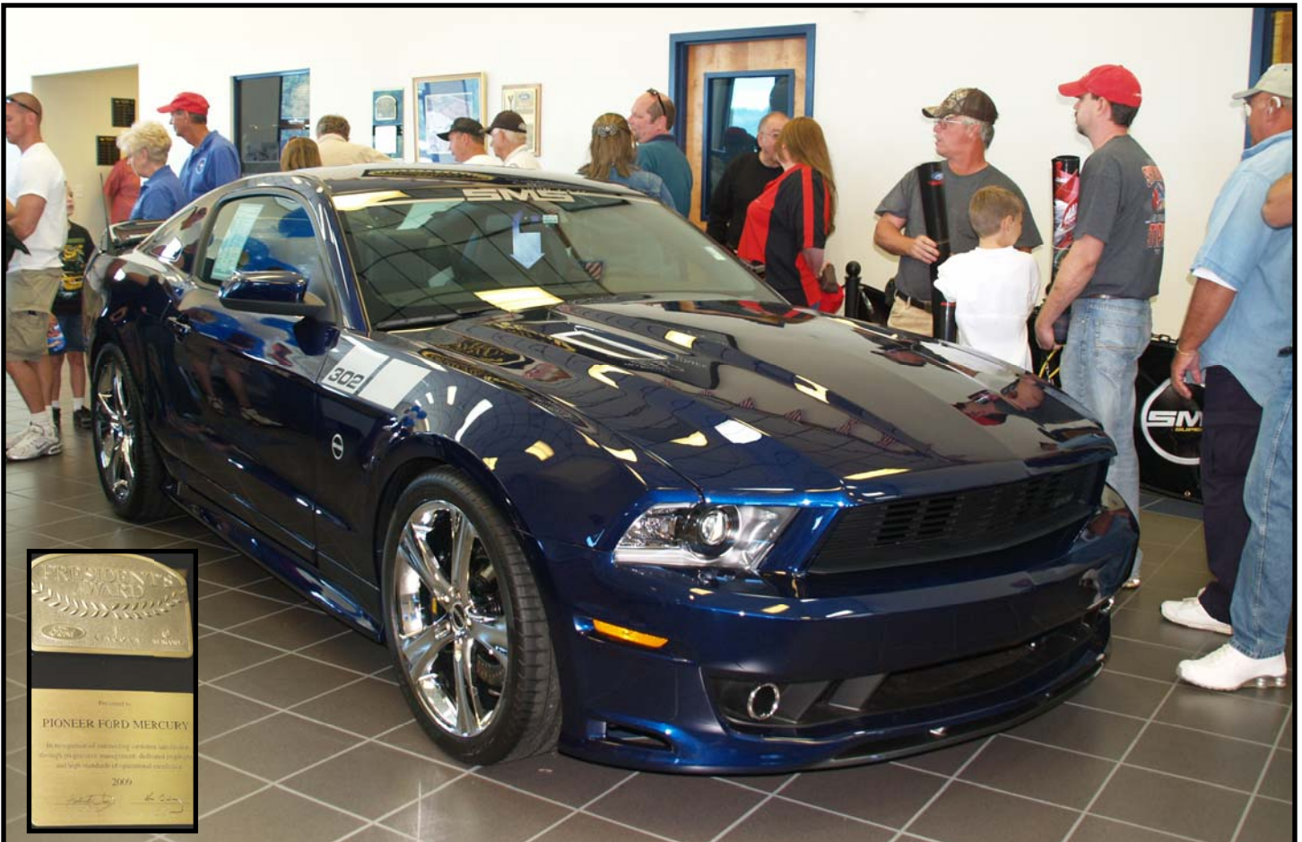
Below: 2011 SMS 302 Mustang.