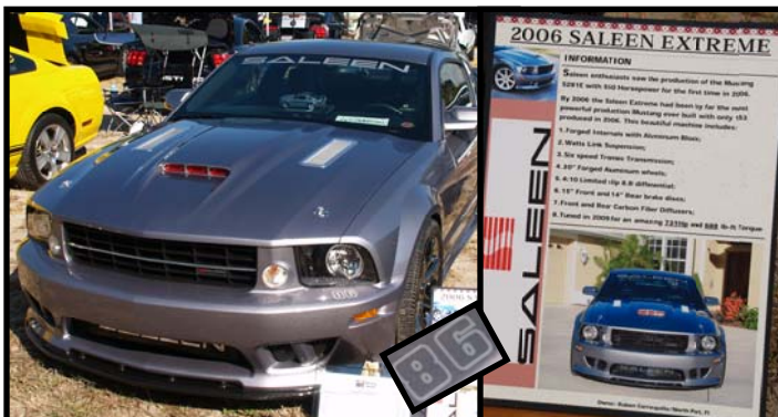
Above: S281 Extreme #06-0086 with modifications to produce 731 HP and 688 ft-lb torque.