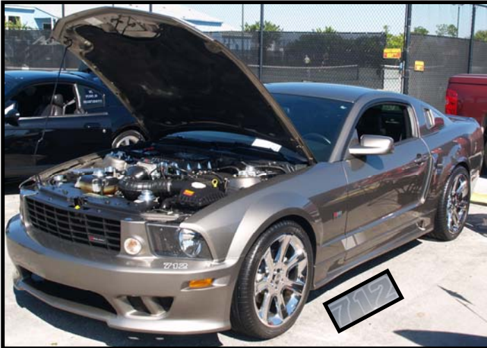
Above: S281 Saleen # 05-0712