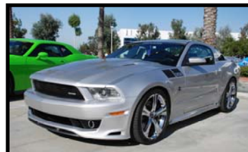
Above, right, & below: 2011 SMS 302 Mustang #11-026