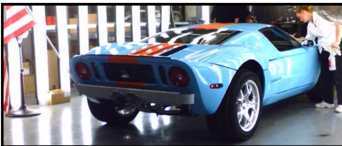
Above: Troy, Michigan, August 31, 2006 - inspection of the last Ford GT produced for sale in the USA. This production was followed by a run of Ford GT's for sale in Canada.

Let's get back to the Ford GT 40. Due to naming rights problems, the vehicle became the Ford GT. Finally in 2005, the Ford GT production began at the Troy, Michigan production facility. 95% of each car was built by Saleen, Inc. in Troy, Michigan. To satisfy a need to involve the United Auto Workers (UAW), space at the Ford Wixom plant was rented by Saleen, Inc. Each Ford GT, 95% completed, was trucked from Troy to the Wixom plant where UAW Workers installed the seats, added the fluids to each car, started the cars, completed dyno testing and road testing on the track, and then certified each vehicle as a completed Ford GT. 4,038 Ford GTs were built. When the Ford project was completed in 2006, Saleen, Inc. investor manage-