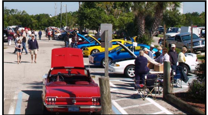
Above: Show field, Mustang Club of Charlotte County's show, November 7, 2010.