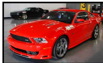
Above: 2011 SMS 302 Mustang #11-0023