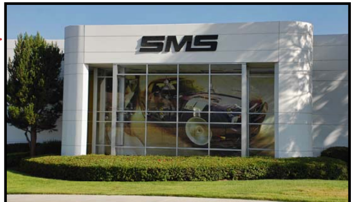
Above: SMS Supercars, 2735 Wardlow Rd., Corona, California. Photo taken at the SMS Supercars Show on September 18, 2010. See page 6 for more photos and story.