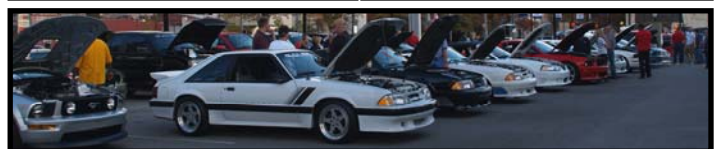
Above and right: Saleens at the Adamson Ford show.