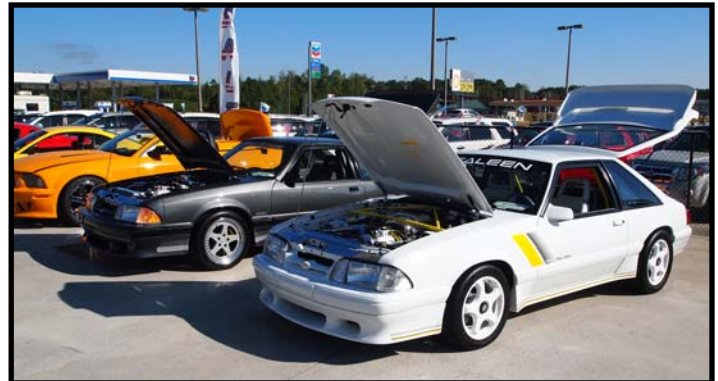
Above and below: Saleen Mustangs on display at Pioneer Ford, Bremen, Georgia on October 3, 2010.