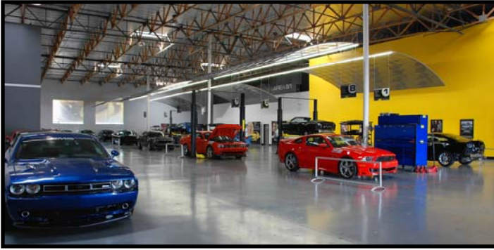
Above: SMS Supercars production facility with SMS Challengers and SMS Mustangs on the line.