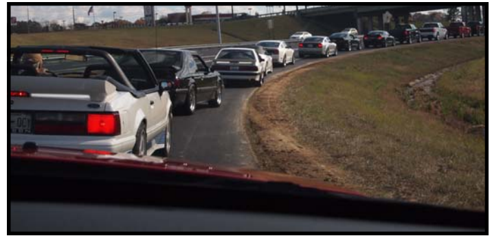
Above and below: November 21, 2010 - On the road to Adamson Ford, Birmingham, Alabama.