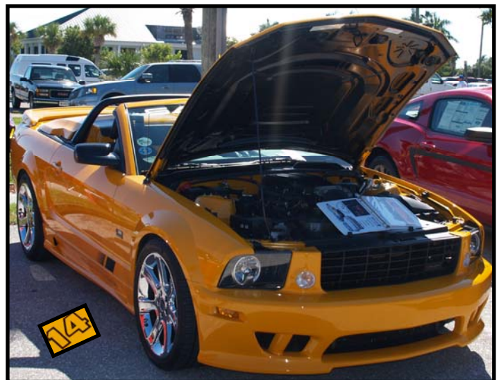
Above: S281 Saleen #07-0014