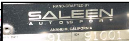
Above: ID tag on Saleen #91-001.