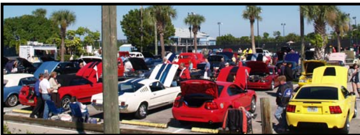
Left: Show field, Mustang Club of Charlotte County's show, November 7, 2010.