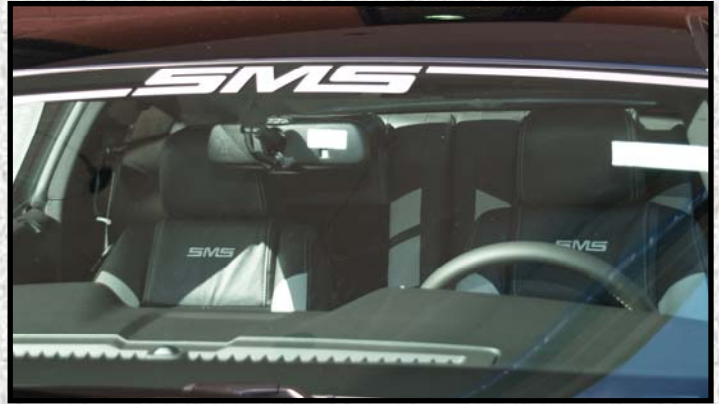
2011 SMS 302 Mustang

SOEC Headquarters P.O. Box 9025 Asheville, NC 28805