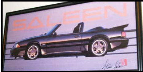
Above: 1993 Saleen Mustang Poster.