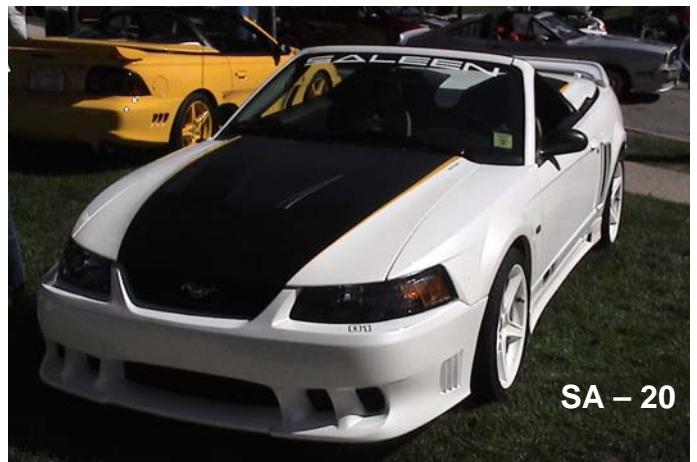
SA - 20