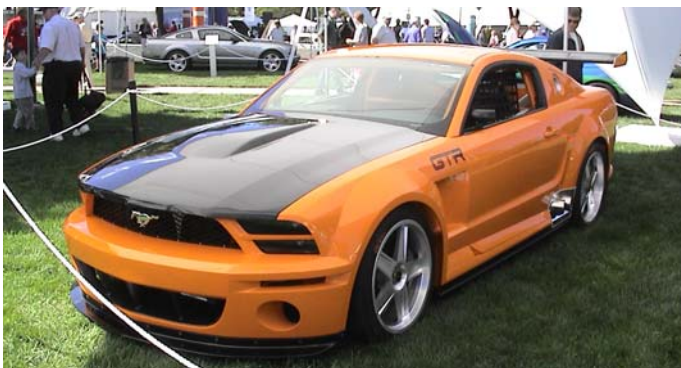
Below: Saleen SA-15