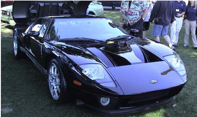
Above: Ford GT, Below: Ford Mustang GTR