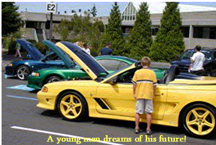
A young man dreams of his future!