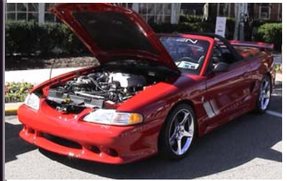
Above: 1997 S351 Below: Ford GT40