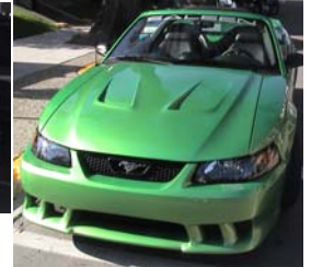
Above: Saleen S281 Below: 1997 S351 at SSV, Saleen Special Vehicles, Troy Michigan