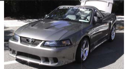
Above: Saleen S7 Left: 1989 SSC Right: 2002 S281 Below Right: SA-10