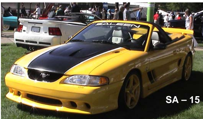
SA - 15