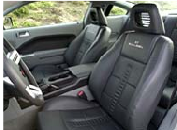
2005 Saleen Mustang